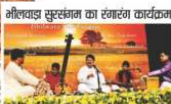
सर्वप्रथम प्रस्तावित है।