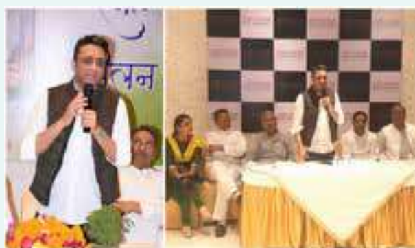
Launch of Jawahar Foundation, Ajmer