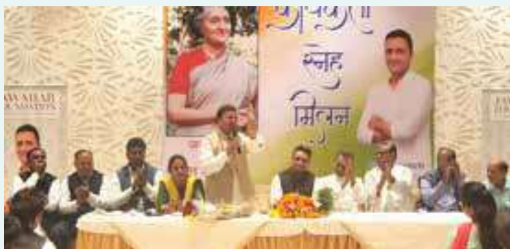
Indira Gandhi Birth Anniversary celebration with local DCC leaders