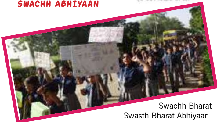
Swachh Bharat Swachh Bharat Abhiyaan was held from 2 nd to 7 th October, 2019.

Students from class V to XII participated to create awareness about its benefits. Classrooms and the surroundings were cleaned, teachers delivered speeches during the assembly, and students held a rally within the School Campus for Swacchata Abhiyaan. Students took oath of keeping the school, home, locality and city clean on the last day of the Abhiyaan.