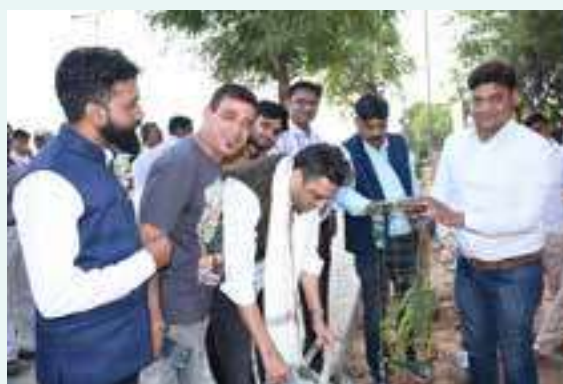
Tree Plantation at Ajmer