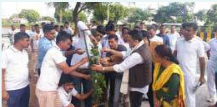
Tree Plantation at Jail Training Institute, Ajmer