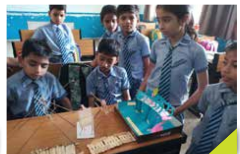
Learning to make bridges and building structures.