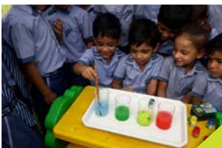
Learning the concept of solubility and properties of water.

Teachers have started designing lessons that highlight content through art. They have aligned themselves with ideals that focus on valuing the learning process as much as the results. They feel liberated and understand their greater roles as educators, facilitators and harbingers of knowledge in developing 21st century skills.