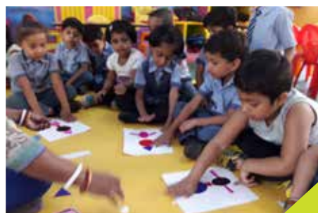
Learning the concept of shapes with art and craft.