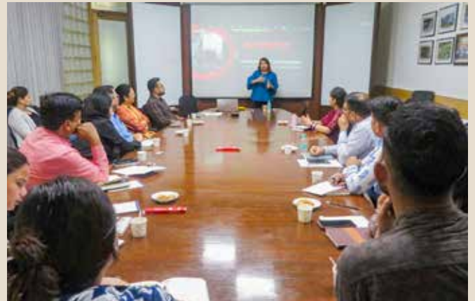
A two-day workshop on the 5X training program in HO Noida to boost efficiency across departments.