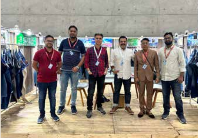
Participation in Bangladesh Denim Expo, showcasing the latest collection & exploring future collaborations.