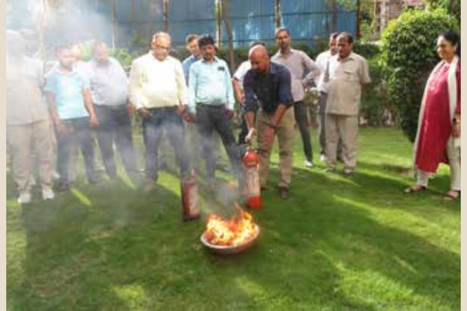
A comprehensive and hands-on training session on fire & electrical safety training