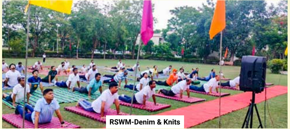
RSWM-Denim & Knits