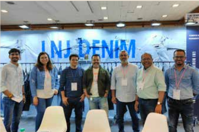
Participation in the 5 th DenimsandJeans show in Bangalore showcasing LNJ Denim's latest