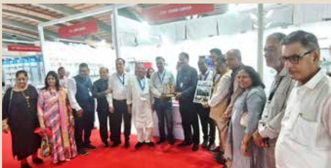
RSWM participated at the Surat Yarn Expo from August 9 to 11, 2024