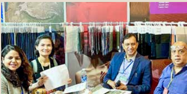
R-value participated in Vitatex in Vietnam, from September 25 to 28, 2024 and was a great success