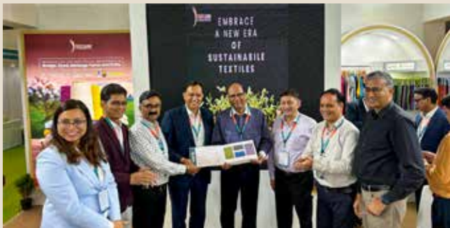
RSWM participated in Yarnex, Delhi and unveiled three exciting collections for the Autumn-Winter 2025-26 season