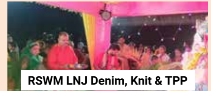
RSWM LNJ Denim, Knit & TPP