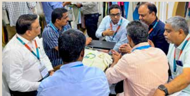
RSWM's participation in Yarnex, Tirupur, from September 12 to 14, 2024