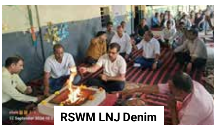
RSWM LNJ Denim