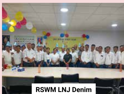
RSWM LNJ Denim

Staff birthday celebrations with all the staff who have their birthdays in the months of July-September were organised at RSWM Ringas, RSWM LNJ Denim, RSWM Lodha, RSWM Mandapam. Cake cutting ceremony was held with high tea.