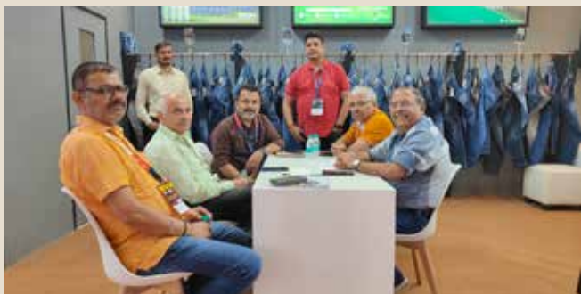
LNJ Denim - Participated in Gartex Texprocess India, New Delhi