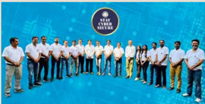
IT department conducted Cyber Awareness Month, strengthening security across the organization