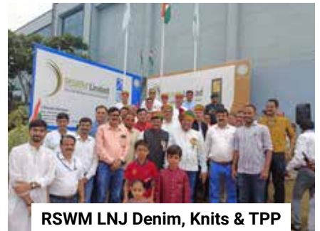
RSWM LNJ Denim, Knits & TPP